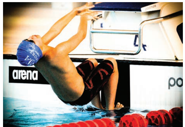
ISA North - Backstroke 2019