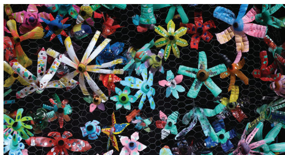
Plastic Garden, Cleve House School (SW)