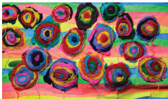
Lollipop Forest, St Christopher's School, Epsom