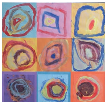
Kandinsky Circles, Torwood House School (SW)