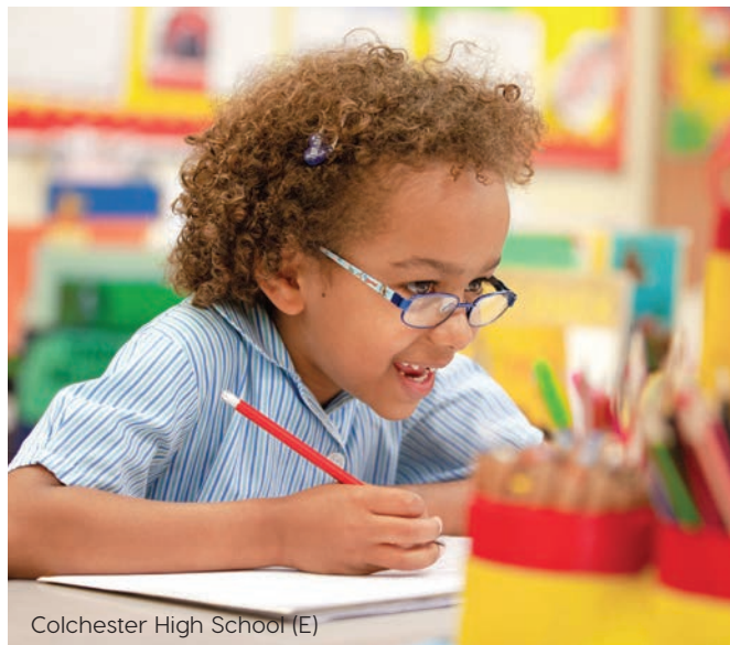
Colchester High School (E)