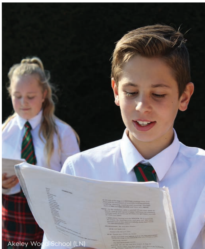
Akeley Wood School

Trying to live up to these kinds of stereotypical ideals about maleness may well be putting a strain on the mental health of the boys in your school. Suicide is the single biggest cause of death for males under 40. 70% of young people who experience mental health issues don't receive appropriate help at an early enough age. 60% of gay and bisexual boys in schools have thought about taking their own lives. And our seemingly harmless comments about how men behave may actually be contributing to a destructive narrative that implies that real men don't talk about their feelings.