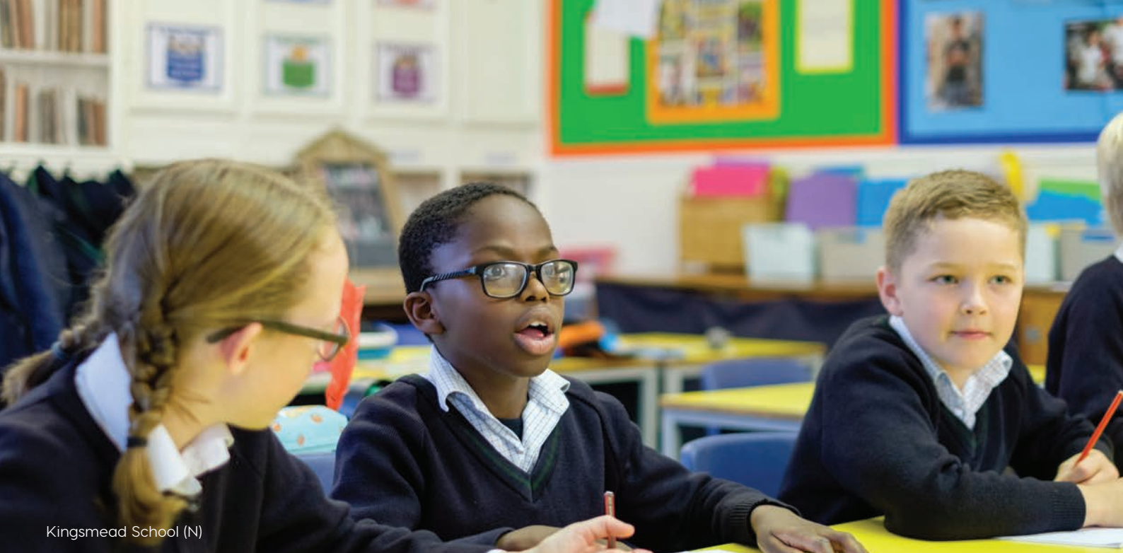
Kingsmead School (N)