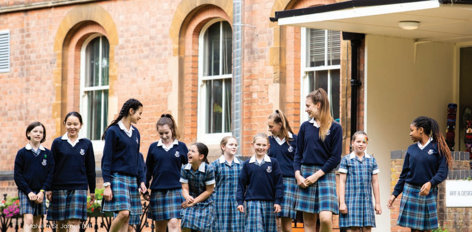
Malvern St James (M)