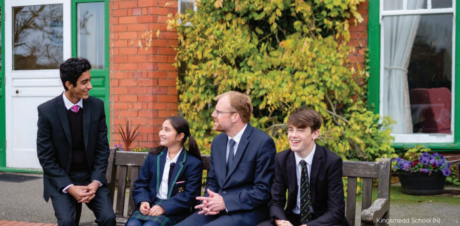
Kingsmead School (N)