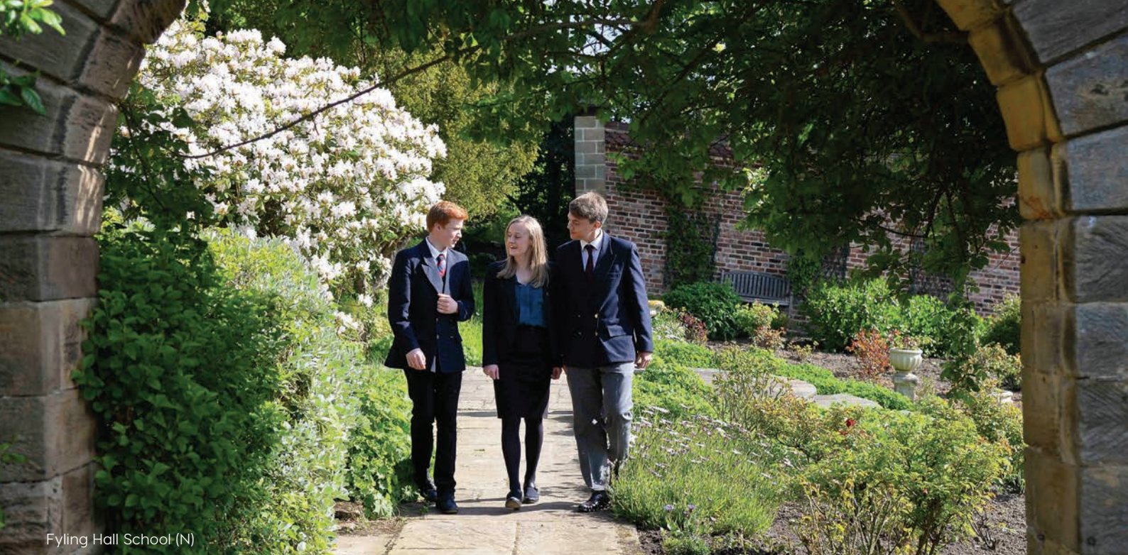
Fyling Hall School (N)