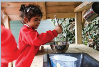
Newbridge Prep School (M)