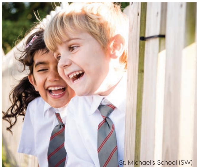
St. Michael's School (SW)

me was swiftly quashed by the Head teacher with an expulsion of the pupil. The trust that had left me two years before returned, my confidence grew when my one examination class achieved some of the best results in the department. It laid the foundation for a rapid rise up the ranks in other schools. In 1993, I joined the Swaminarayan School (TSS) as Head of Senior School. It was not without debate because I was still only thirty-four but once asked, the allure of leading the only Hindu Senior School in the country was something I could not resist.